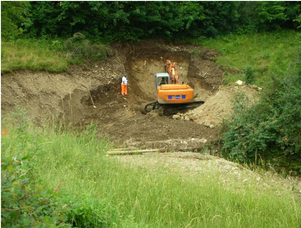
Pipe site after break through of the pilot