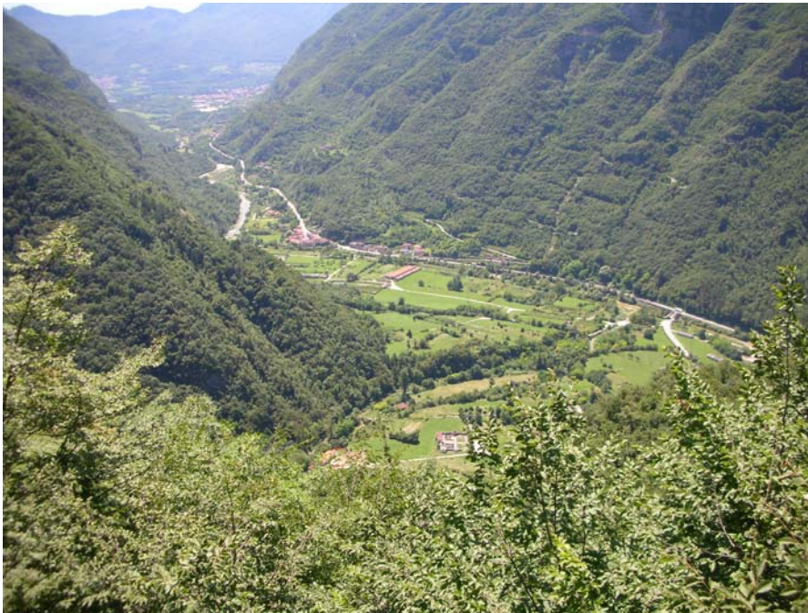
View from the top into the Astico valley