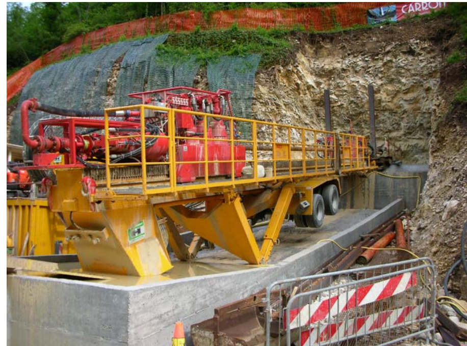
Upwards drilling with 8°