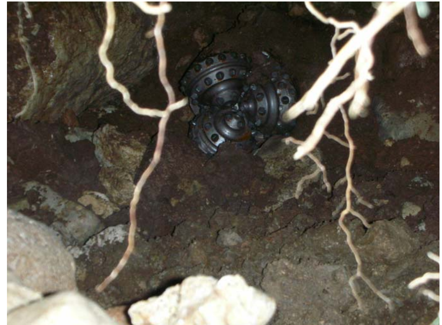
9 7/8" Tri-Cone bit after Pilot