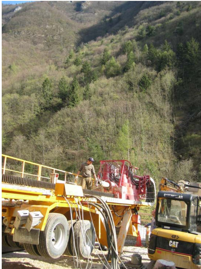
Herrenknecht AG, 2010