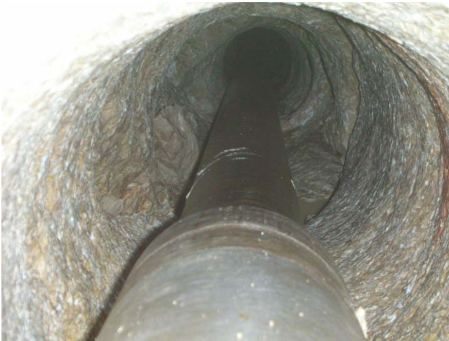
Possibility to go with a camera into the borehole