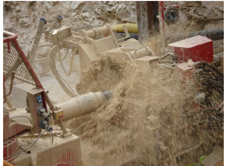
Mud draining at the beginning of changing a drill pipe